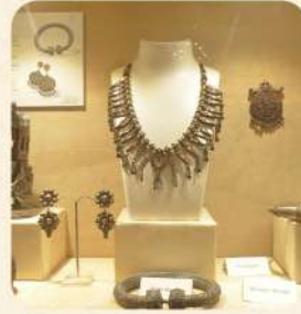
Traditional Jewelry Section