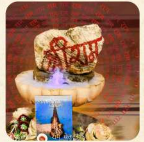
Ram Setu Section